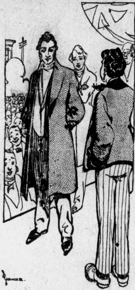
"AND NOW, YOUNG MAN, MAY I ASK YOU A QUESTION?"

The audience appeared somewhat astounded at his impudence, but the