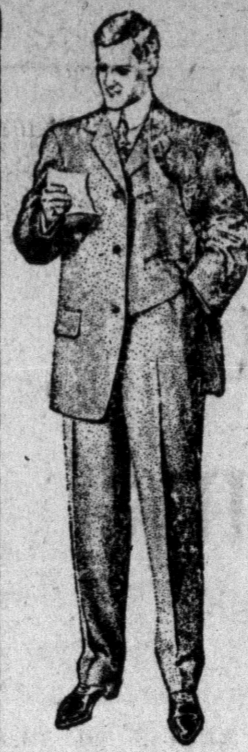
Copyright 1906 R. Kuppenheimer & Co. Chicago

It remains to be seen whether it will be the coal trust or oil trust that will gobble the denaturized alcohol industry.