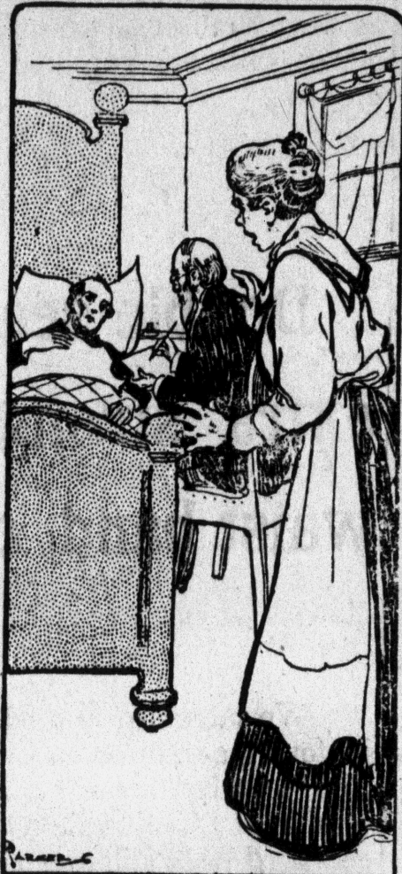
"LUKE BROWN OWES ME $80."

"The old woman, a covetous old soul, was in the room listening to