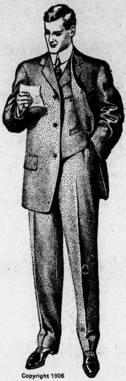
Copyright 1906 B. Kuppenheimer & Co., Chi.

Nothing so handsome, nothing so good for looking well at all times as the Blue serge suit.