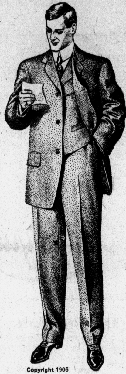
Copyright 1906 S. Kuppenheimer & Co., Chi.

Nothing so handsome, nothing so good for looking well at all times as the Blue serge suit.