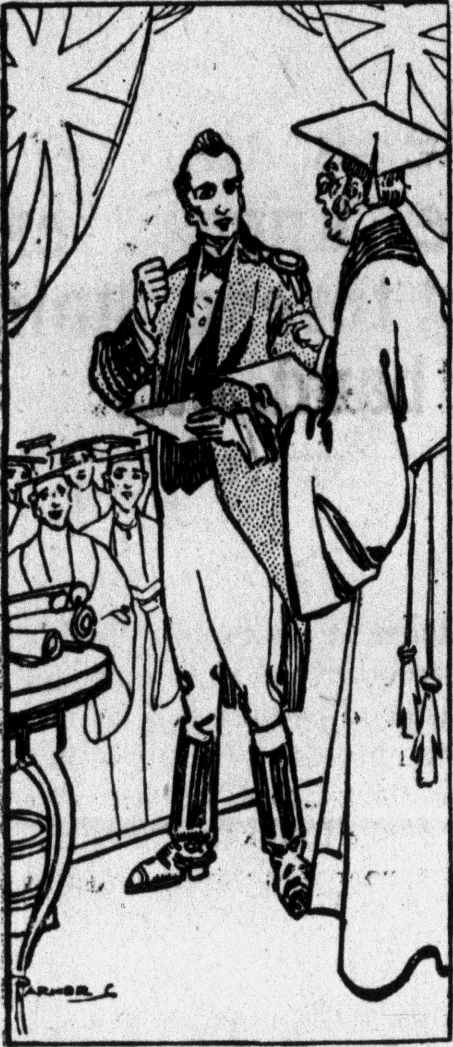
"I BEG YOUR GRACE'S PARDON."