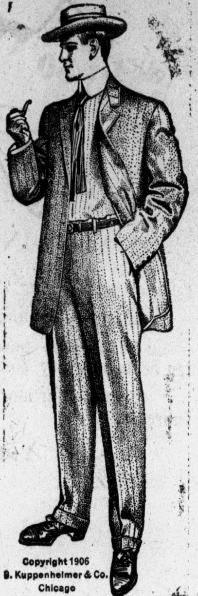
Copyright 1906 S. Kuppenheimer & Co. Chicago