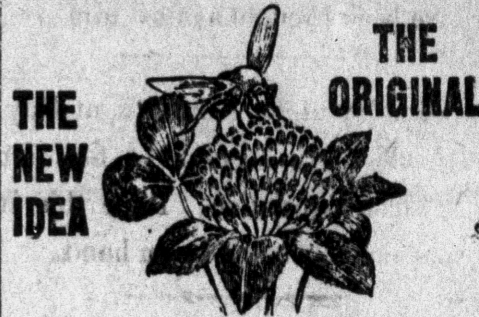
The Red Clover Blossom and the Honey Bee on Every Bottle.

"A Cold or a Cough nearly always produces constipation—the water all runs to the eyes, nose and throat instead of passing out of the system through the liver and kidneys. For the want of moisture the bowels become dry and hard."