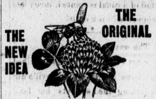
The Red Clover Blossom and the Honey Bee on Every Bottle.

"A Cold or a Cough nearly always produces constipation—the water all runs to the eyes, nose and throat instead of passing out of the system through the liver and kidneys. For the want of moisture the bowels become dry and hard."