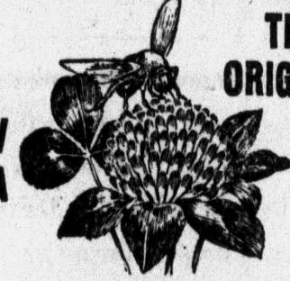
The Red Clover Blossom and the Honey Bee on Every Bottle.

"A Cold or a Cough nearly always produces constipation—the water all runs to the eyes, nose and throat instead of passing out of the system through the liver and kidneys. For the want of moisture the bowels become dry and hard."