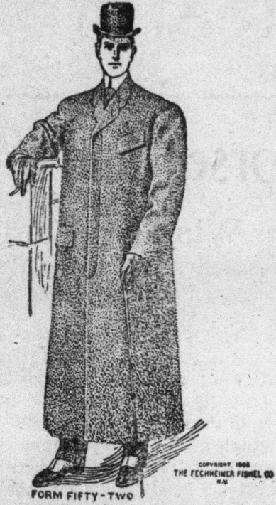
"EFF-EFF" FORM FIFTY-TWO

Let us set you straight on the matter of Cravenette Overcoats. The most successful process for waterproofing a garment is that of Priestley's, and every Cravenette treated to their process bears their name, and when in addition to Priestley's Cravenette stamp an overcoat is identified with the label of Wilkinson the combination is one that insures not only a waterproof overcoat, but also an overcoat of fine fabric, with all the knocks of fashion and style that distinguish the "EFF EFF" Clothing people from the ordinary sort.