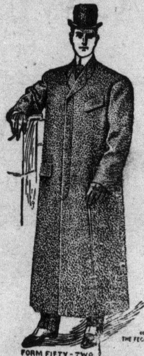
FORM FIFTY-TWO "EFF-EFF"

Let us set you straight on the matter of Cravenette Overcoats. The most successful process for waterproofing a garment is that of Priestley's, and every Cravenette treated to their process bears their name, and when in addition to Priestley's Cravenette stamp an overcoat is identified with the label of Wilkinson the combination is one that insures not only a waterproof overcoat, but also an overcoat of fine fabric, with all the knicks of fashion and style that distinguish the "EFF EFF" Clothing people from the ordinary sort.