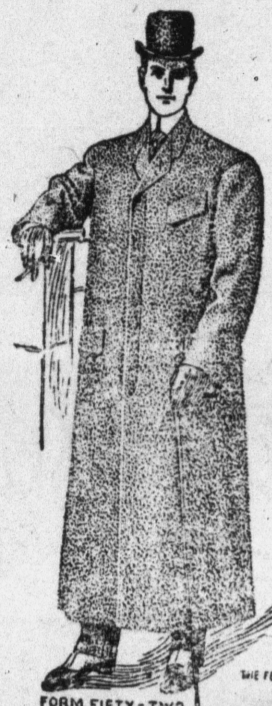
FORM FIFTY-TWO "EFF-EFF"

Let us set you straight on the matter of Cravenette Overcoats. The most successful process for waterproofing a garment is that of Priestley's, and every Cravenette treated to their process bears their name, and when in addition to Priestley's Cravenette stamp an overcoat is identified with the label of Wilkinson the combination is one that insures not only a waterproof overcoat, but also an overcoat of fine fabric, with all the knocks of fashion and style that distinguish the "EFF EFF" Clothing people from the ordinary sort.