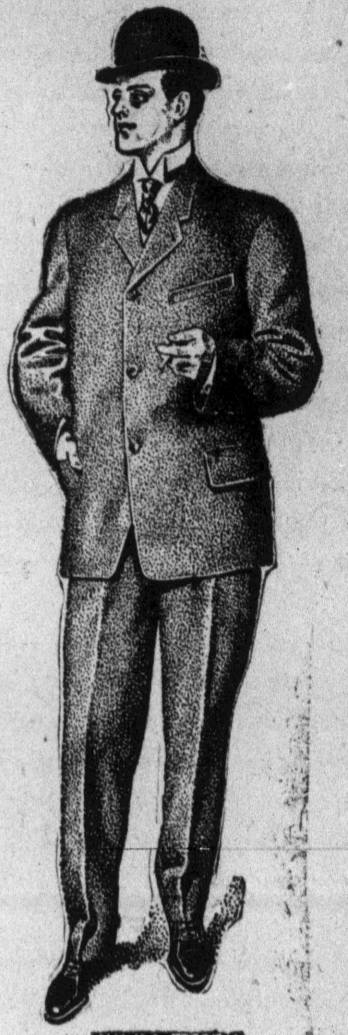
COPYRIGHT 1905 BY THE HOUSE OF KUPPENHEIMER

You'll be surprised to learn what $10 or $15 will do for you here in the way of Suitsing you.