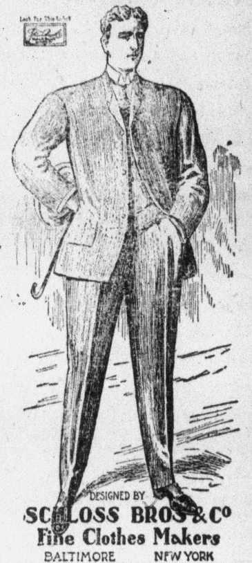
DESIGNED BY SCLOSS BROS & CO Five Clothes Makers BALTIMORE NEW YORK

of superfluous cloth anywhere, while the graceful lines and natty appearance of the garments are up to our usual and excellent standard.