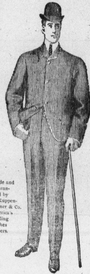
Made and Guaranteed by B. Kuppenheimer & Co. America's Leading Clothes Makers.

Think of it, next Sunday is Easter. Are you prepared to