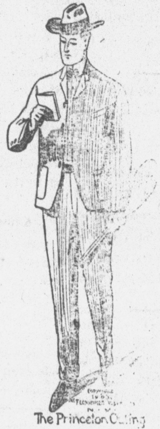
The Princeton Cutting

A vest is a useless piece of furniture on hot Summer days. Our Two-Piece Suits are designed to furnish a valid excuse for not wearing one.