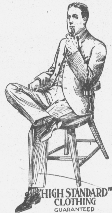
"HIGH STANDARD" CLOTHING GUARANTEED

WANTS HIS SPRING SUITS READY TO PUT ON THE MOMENT HE FEELS LIKE WEARING IT