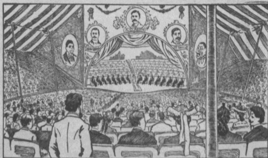
SHOWING UNDER A MAMMOTH CANVAS THEATRE SEATING 2,000 PEOPLE BEING THE MOST COMPLETE PORTABLE THEATRE EVER ERECTED IN AMERICA.