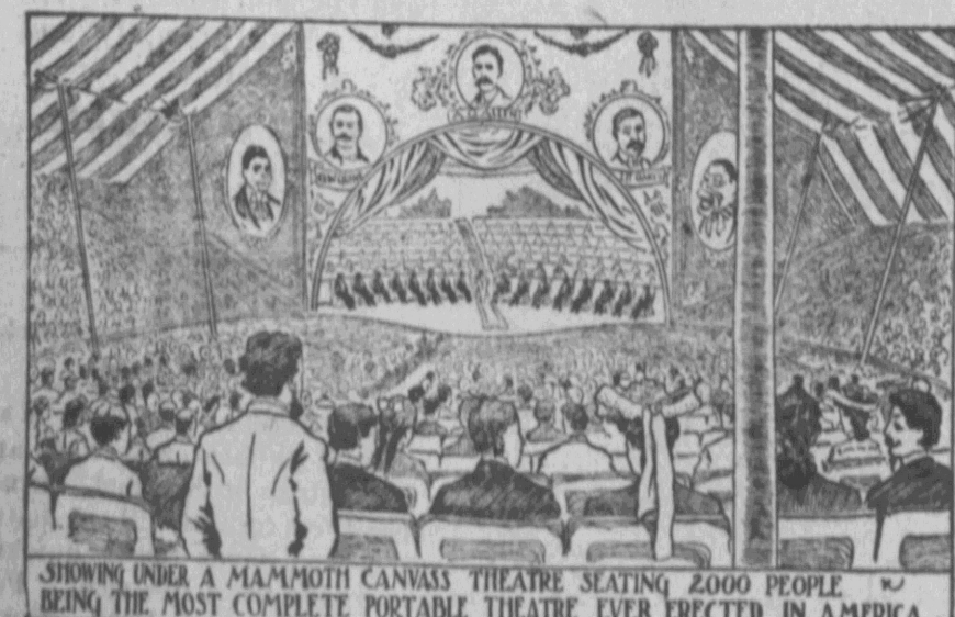
SHOWING UNDER A MAMMOTH CANVASS THEATRE SEATING 2000 PEOPLE BEING THE MOST COMPLETE PORTABLE THEATRE EVER ERRECTED IN AMERICA.

Admission, 25 and 35 cents. Seats for 2,000 people.