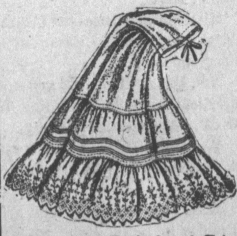
Muslin Skirt, Tucked and Trimmed with Tucked Cambric Flounce. 94c