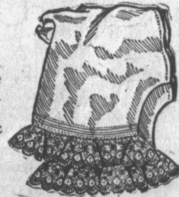
Muslin Drawers, Umbrella. Three clusters of tucks. Ruffle of Hamburg edge. 48c