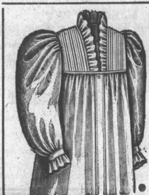
Muslin Gown, square neck. Yoke trimmed with Hamburg Insertion and alternate sized tucks. Neck and sleeves trimmed with Cambric ruffles. 39c

Just back from New York. Everything bright and new and up-to-date.