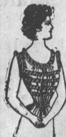
V Neck Corset Cover, trimmed with Hamburg Insertion between hemstitched tuck and hemstitched lawn ruffle. 39c