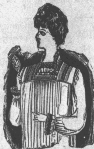
Muslin Gown, yoke of Swiss Embroidery, Insertion and Ribbon through Ribbon Beading. Lawn ruffle trimmed with Swiss Embroidery on neck and sleeves. 98c