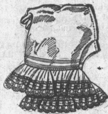
Cambric Umbrella Drawers, deep flounce, trimmed with two rows Torchon Insertion and edged with lace. 98c