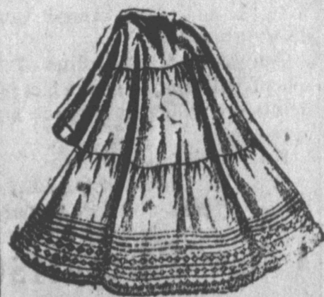
Muslin Skirt, Three Tucks and Wide Hem. 29c