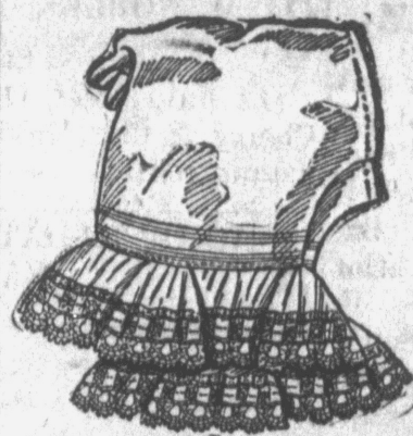
Cambric Umbrella Drawers, deep flounce, trimmed with two rows Torchon Insertion and edged with lace. 98c