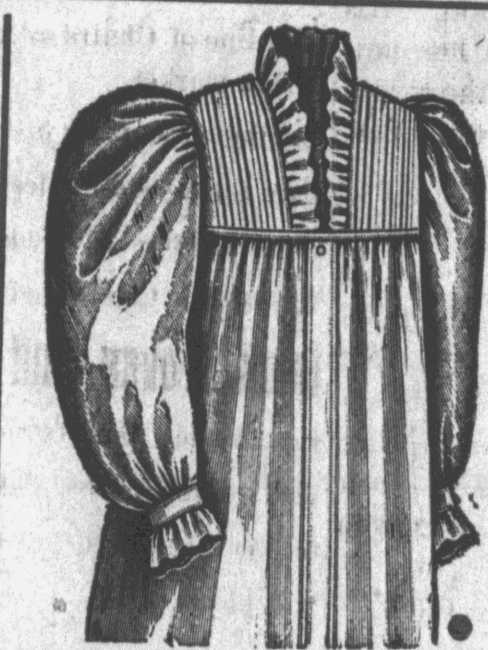
Muslin Gown, square neck. Yoke trimmed with Hamburg Insertion and alternate sized tucks. Neck and sleeves trimmed with Cambric ruffles. 39c

Just back from New York. Everything bright and new and up-to-date.