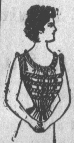
V-Neck Corset Cover, trimmed with Hamburg Insertion between hemstitched tucks and hemstitched Lawn ruffle. 39c