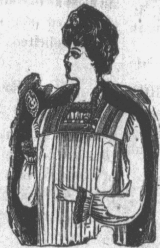
Muslin Gown, yoke of Swiss Embroidery, Insertion and Ribbon through Ribbon Beading. Lawn ruffle trimmed with Swiss Embroidery on neck and sleeves. 98c