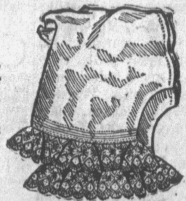
Muslin Drawers, Umbrella. Three clusters of tucks. Ruffle of Hamburg edge. 49c