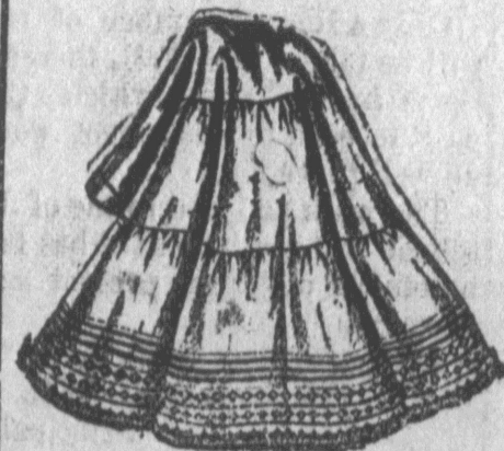
Muslin Skirt, Three Tucks and Wide Hem. 29c