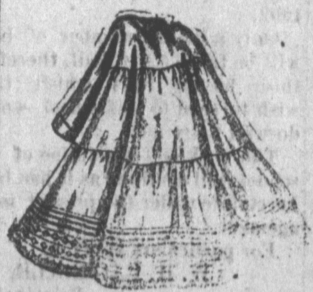
Muslin Skirt, Three Tucks and Wide Hem. 29c