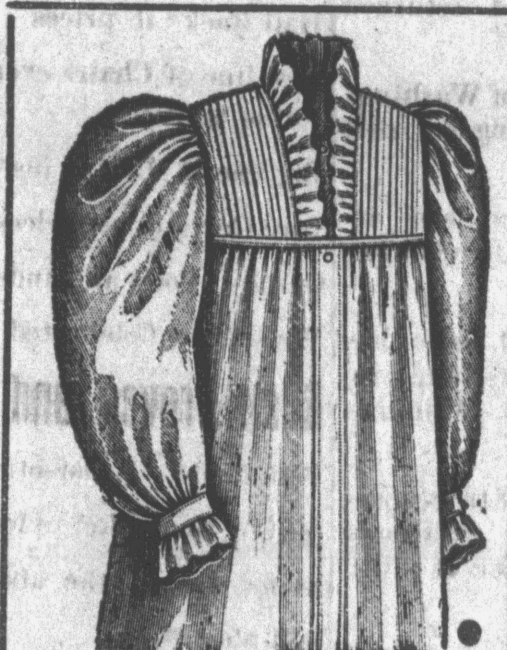
Muslin Gown, square neck. Yoke trimmed with Hamburg Insertion and alternate sized tucks. Neck and sleeves trimmed with Cambric ruffles. 39c

Just back from New York. Everything bright and new and up-to-date.