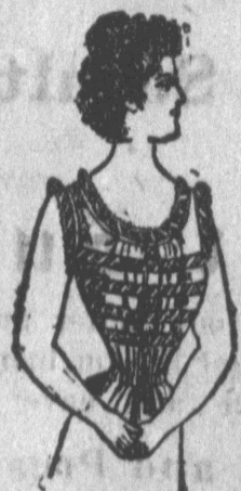
V-Neck Corset Cover, trimmed with Hamburg Insertion between hemstitched tucks and hemstitched Lawn ruffle. 39c