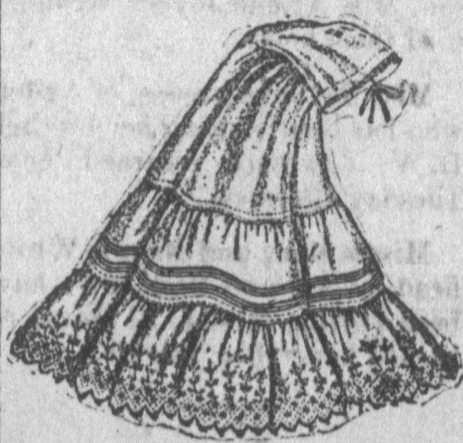
Muslin Skirt, Tucked and Trimmed with Tucked Cambric Flounce. 94c