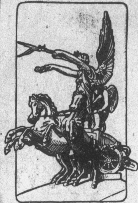
QUADRIGA FOR UNITED STATES GOVERNMENT BUILDING.

The United States government has appropriated $500,000 for an exhibit at the Pan-American Exposition at Buffalo next summer. To view the magnificent buildings and their multitude of treasures alone would be well worth going a long distance. They are much more beautiful than those of the government group at the Columbian Exposition, while the space for exhibition purposes is but little less than was oc-