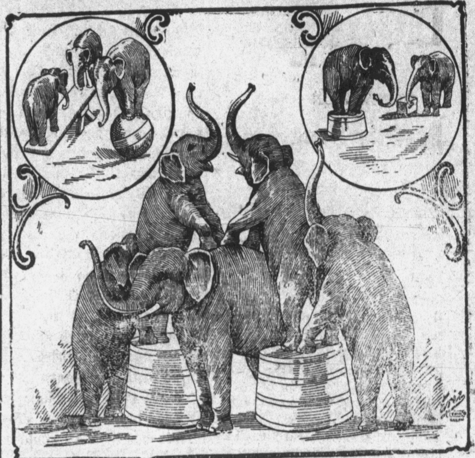
MAMMOTH MENAGERIE AND REAL HIPPODROME.

"The Rhoda Royal Shows was good, big and moral."—Worcester Spy, August 29, 1900.