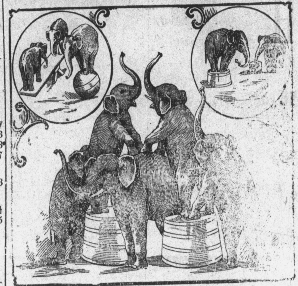
MAMMOTH MENAGERIE AND REAL HIPPODROME.

"The Rhoda Royal Shows was good, big and moral."—Worcester Spy, August 29, 1900.