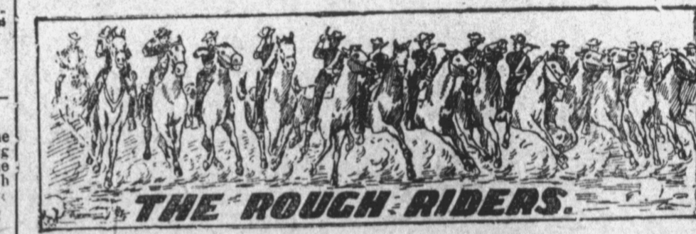
THE ROUGH RIDERS.