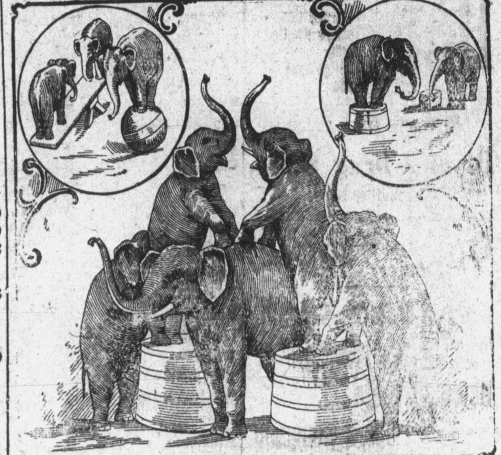
MAMMOTH MENAGERIE AND REAL HIPPODROME.

"The Rhoda Royal Shows was good, big and moral."—Worcester Spy, August 29, 1900.