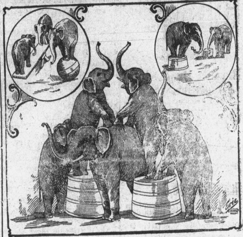
MAMMOTH MENAGERIE AND REAL HIPPODROME.

"The Rhoda Royal Shows was good, big and moral."—Worcester Spy, August 29, 1900.