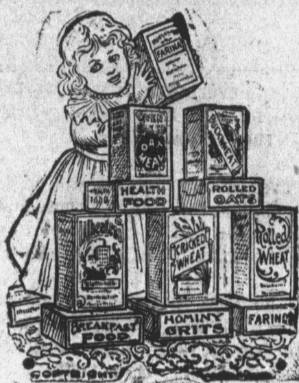
Something New and Fresh to Eat.

Buckwheat, Pancake Flour, Cream of Wheat, Oat Meal, Cracker Meal, Hominy Grits, highest grade Mason Cracker, Uneda Graham Wafers, Hinzes' sweet and sour Pickles, Prunes, Raisins and Dates and a greater assortment of canned goods that I have ever handled before.