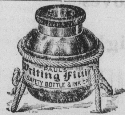
10c Wire Stand 5c