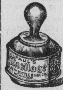
10 ct s.