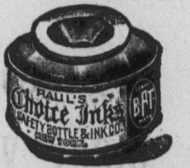
5 & 10 cents.