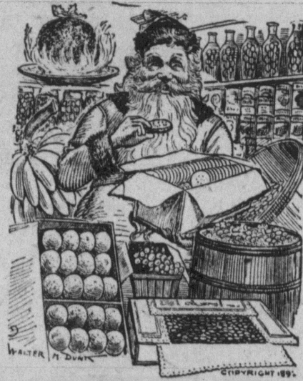
ENJOYING AN XMAS FEAST

is what everyone in Greenville is looking forward to in the season of good fellowship and merriment, and right here at our store will be found all the delicious morsels in cakes and candies, choice fruits, celery, cranberries, fancy oranges and apples, nuts, raisins and everything else you can think of. For your Christmas baking we have the finest pastry flour, flavoring extracts pure spices as well as pickles and jellies at bed rock prices.