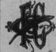
On Each Box.