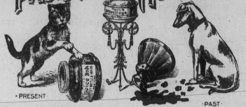
Automatic Ink Stand that will not spill when upset. Absolutely non-evaporating.

THE MOST IMPORTANT INVENTION IN THIS LINE EVER ACCOMPLISHED.