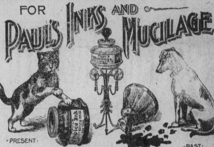
PRESENT: Automatic Ink Stand that will not spill when upset. PAST: Absolutely non-evaporating.

THE MOST IMPORTANT INVENTION IN THIS LINE EVER ACCOMPLISHED.