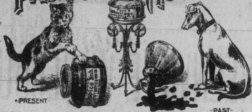
Automatic Ink Stand that will not spill when upset. Absolutely non-evaporating.

THE MOST IMPORTANT INVENTION IN THIS LINE EVER ACCOMPLISHED.