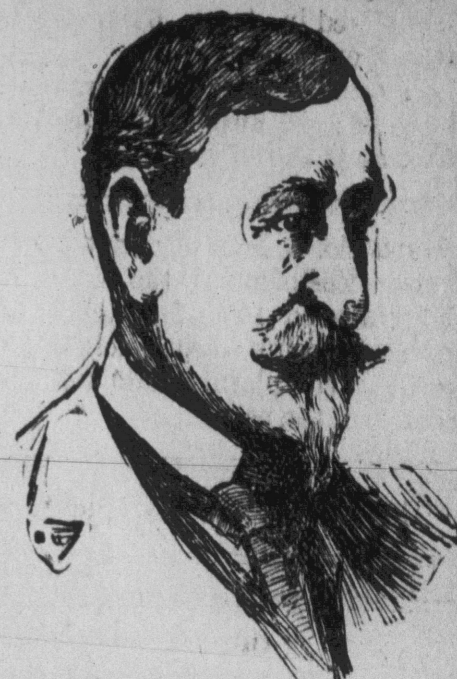
COMMODORE W. S. SCHLEY.