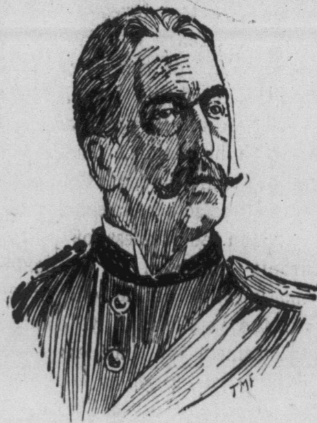
MAJOR-GENERAL NELSON A. MILES.