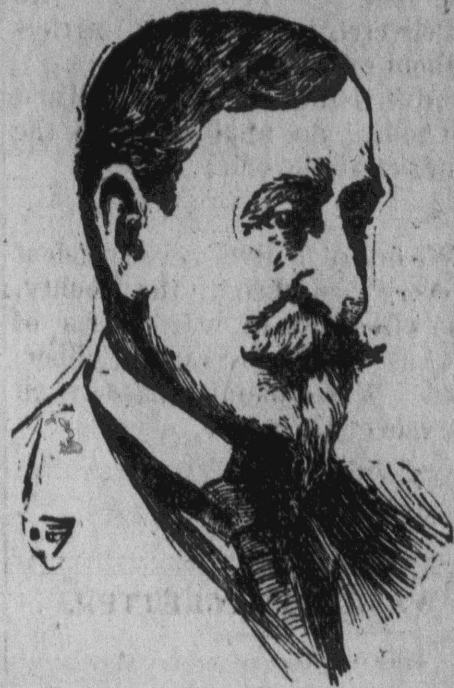
COMMODORE W. S. SCHLEY.