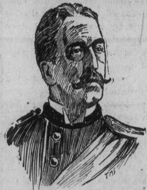
MAJOR-GENERAL NELSON A. MILES.