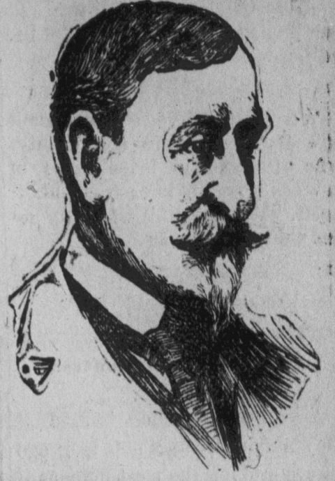
COMMODORE W. S. SCHLEY.