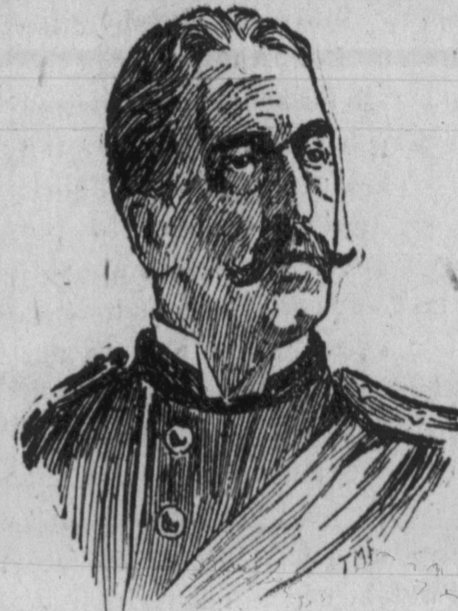
MAJOR-GENERAL NELSON A. MILES.