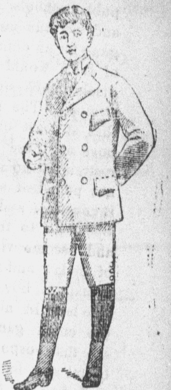
"A Mrs. Hopkins Boy."

than it does of us—a full hundred cents' worth of quality. Nobby sack and cutaway suits of fine cassimeres, tweeds and worsteds—good many plaids that are so fashionable and neat mixed effects. Color, quality, making and fit confidently guaranteed. We ask you to come