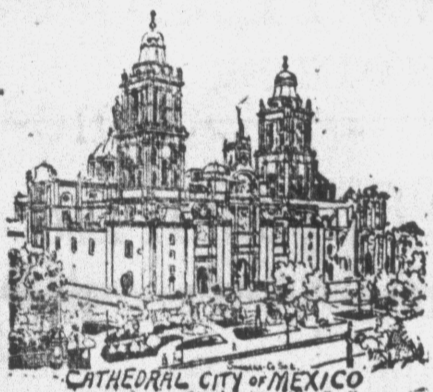
CATHEDRAL, CITY OF MEXICO

After breakfasting we started out again. This time many people were seen wending their way to a splendid cathedral, just across the plaza from the hotel, where mass was held at 9 o'clock. Curiosity, and a desire to see the people assembled together, impelled us hither. As a rule the cathedrals of Mexico are exceedingly hand-