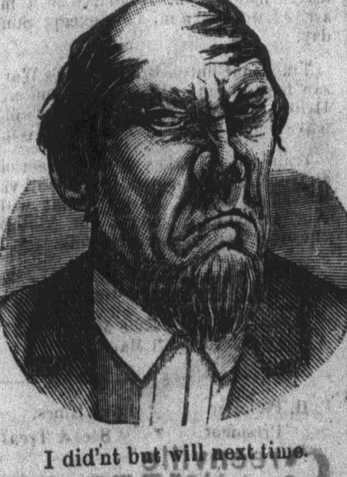
I didn't but will next time.