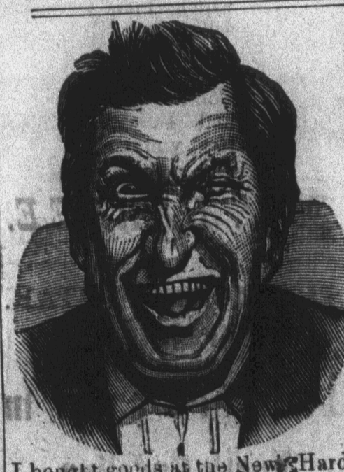
I bought goods at the New Hardware Store.