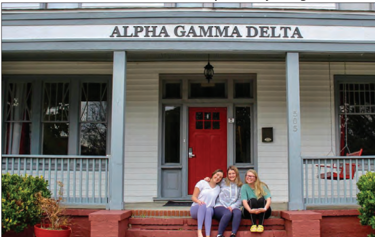
HALIE MILLER | THE EAST CAROLINIAN