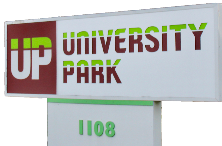
HALIE MILLER | THE EAST CAROLINIAN