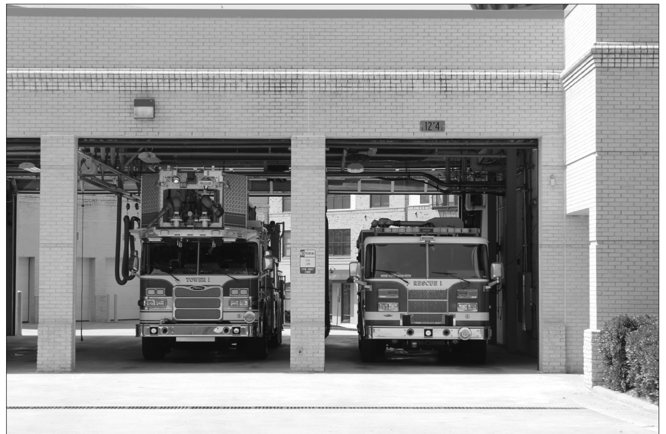
MICHAELA EMORY | THE EAST CAROLINIAN

"Greenville Fire/Rescue is excited that the City Council has recognized and supported the need for Station Seven,"