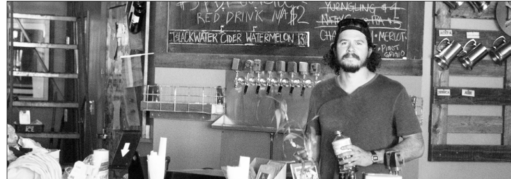
LESLIE DZORVAKPOR | THE EAST CAROLINIAN

"We changed the theme to be more of a cel-