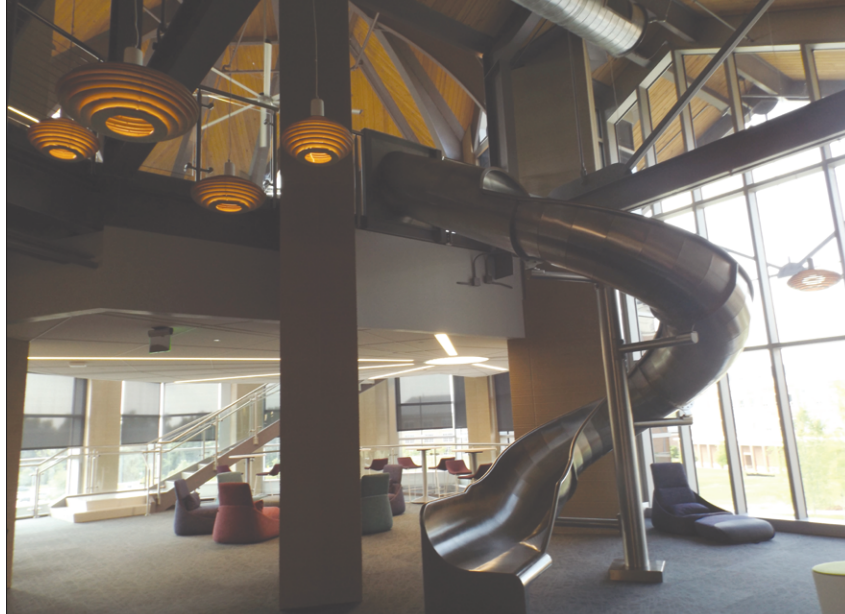
The new student center at the ECU health sciences campus includes a slide for students.