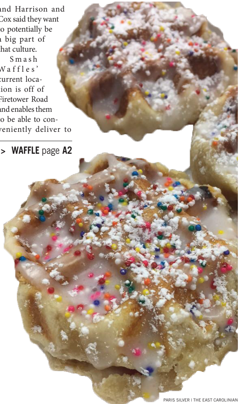
PARIS SILVER | THE EAST CAROLINIAN