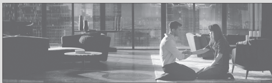
Actors Jamie Dornan and Dakota Johnson sit on the floor in the racy movie "Fifty Shades Darker."

The film centers around the idea of Christian Grey, played by Jamie Dornan, giving in to the needs of Anastasia Steele, played by Dakota Johnson. It's the switching of roles from Mr. Grey that drags the audience in as he has become the submissive to Anastasia. He is willing to give up his alternative lifestyle and try