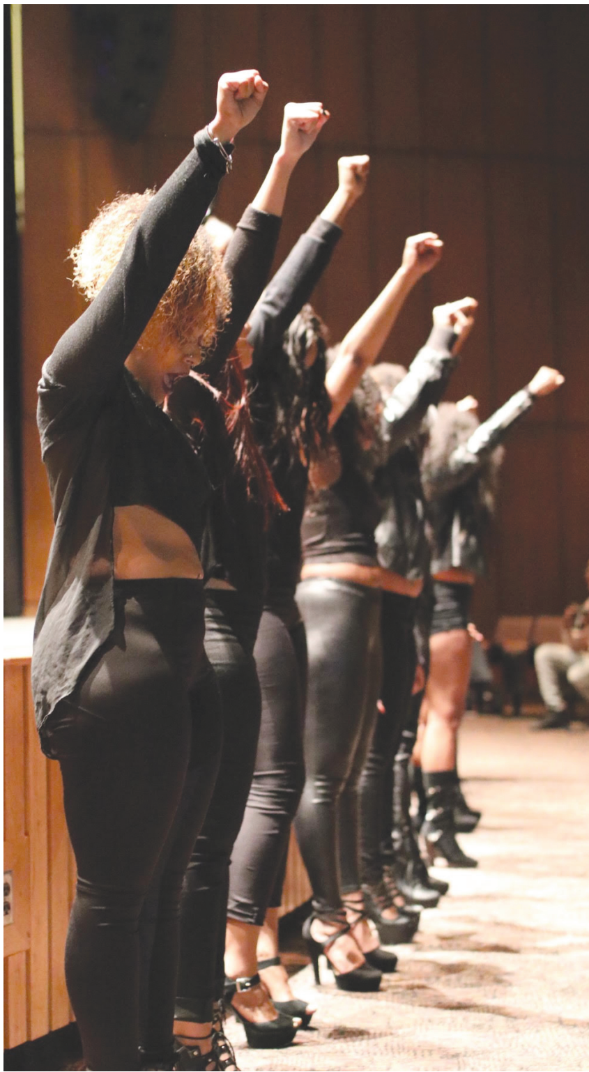
ANDREW CARROLL | THE EAST CAROLINIAN

Ticket 3, Rogers and Smith, are focusing on a campaign rooted in strategy as they > ELECTION page A2