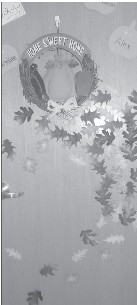
Students tape decorations to their doors to celebrate fall.

This upcoming Thanksgiving calls for some festive decorations to be in season.