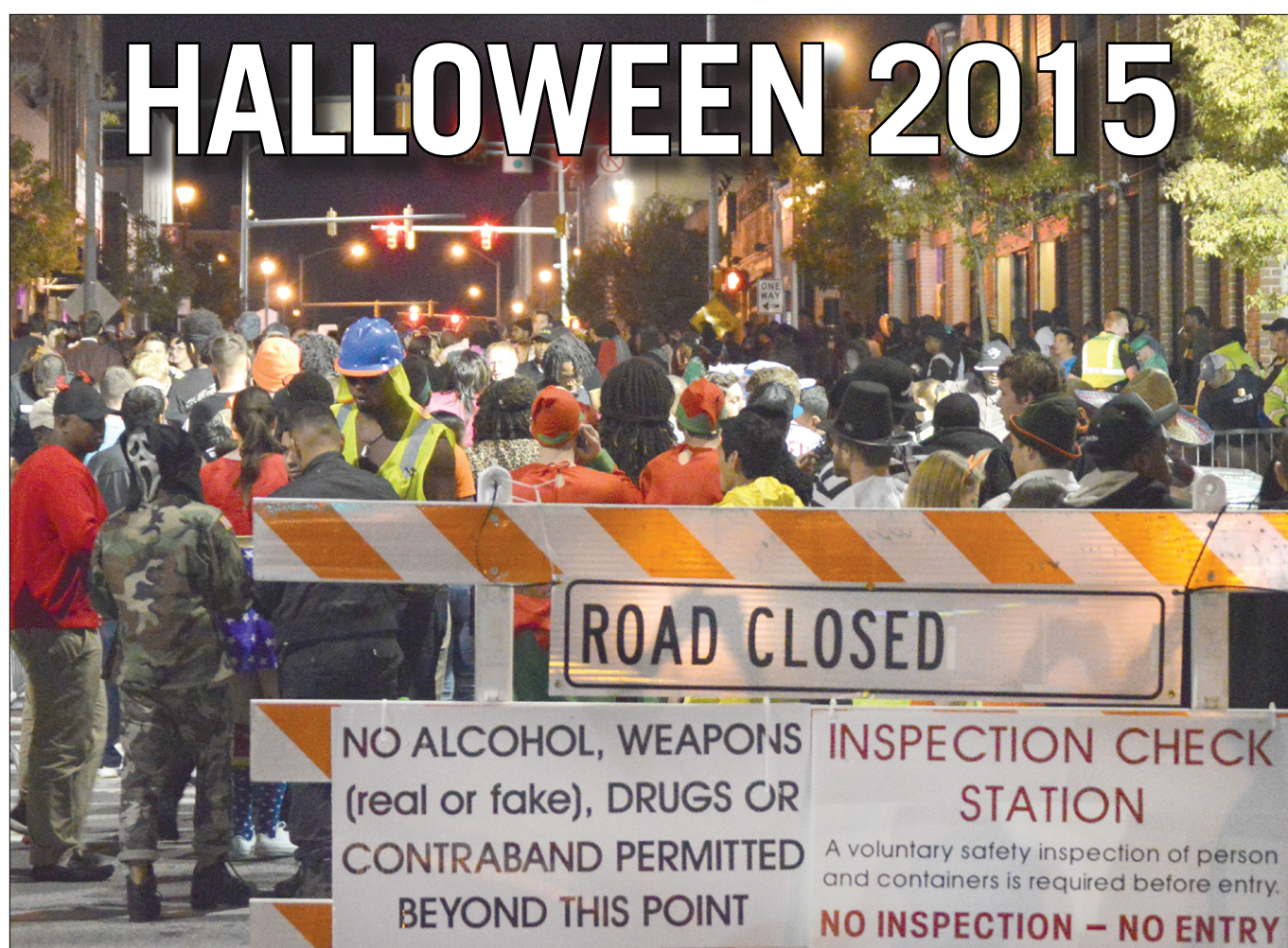
Students and Greenville guests flood the Fifth Street area of downtown Halloween night. Police blocked off the area and had checkpoints.

For questions or comments, contact news@theeastcarolinian.com.