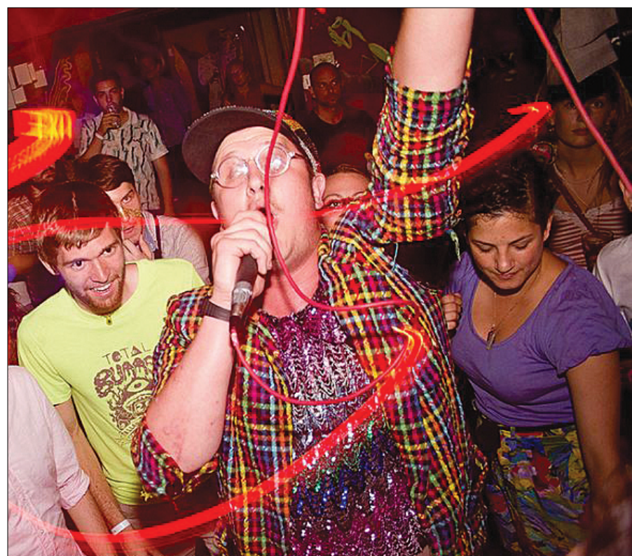
METH DAD's lead singer finds himself in the center of a packed crowd at a recent performance.