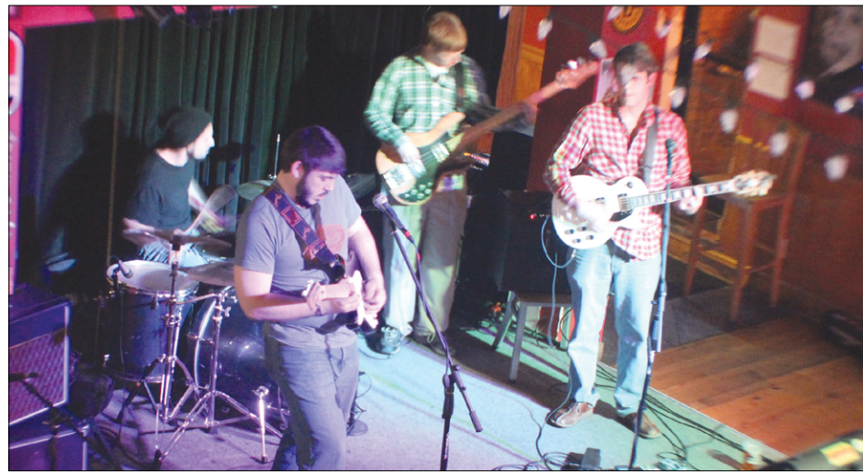
The Greenville native group performs at Crossbones, where they are set to play this weekend. WEB PHOTO | REVERBATION