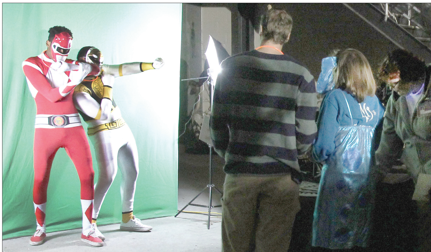
Students dressed in costumes pose in front of a green screen during last year's Midnight Madness event, now known as Halloween Havoc. ARCHIVED | THE EAST CAROLINIAN