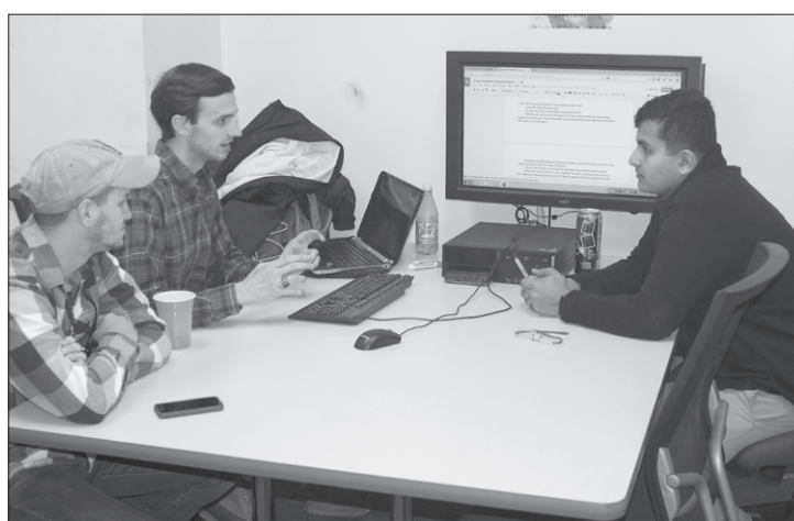
Members of the Presidents Council plan the agenda for the first meeting.