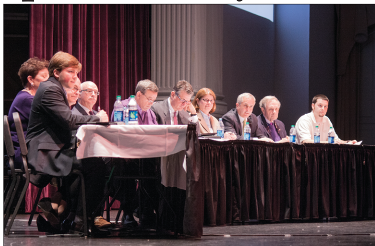
The Board of Trustees listens to public opinions on the renaming of Aycock.