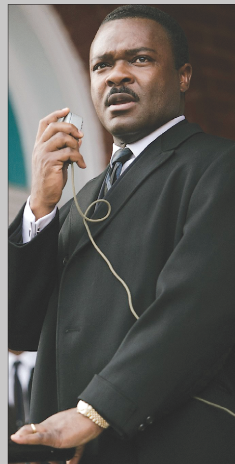
Selma features the civil rights leader, MLK.

This writer can be contacted at arts@theeastcarolinian.com.