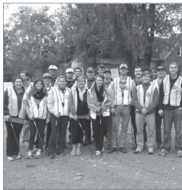
Volunteers gathered together to help clean up the grid area.

This writer can be contacted at news@theeastcarolinian.com.