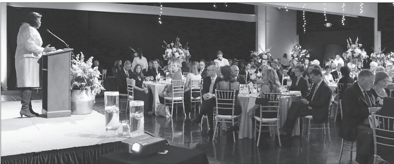
Attendees at the annual Festival of Hope gala helped raise money for cancer support and survivorship programs offered at Vidant.