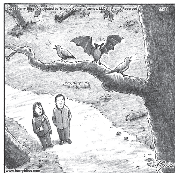
"They sound lovely, except that one in the middle."